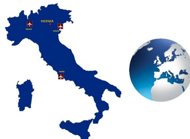
Framework Nation: Italy