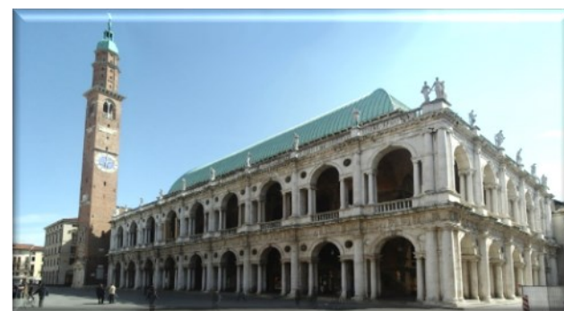
Vicenza – (Italy) – The Basilica Palladiana

More information available @ www.nspcoe.org .