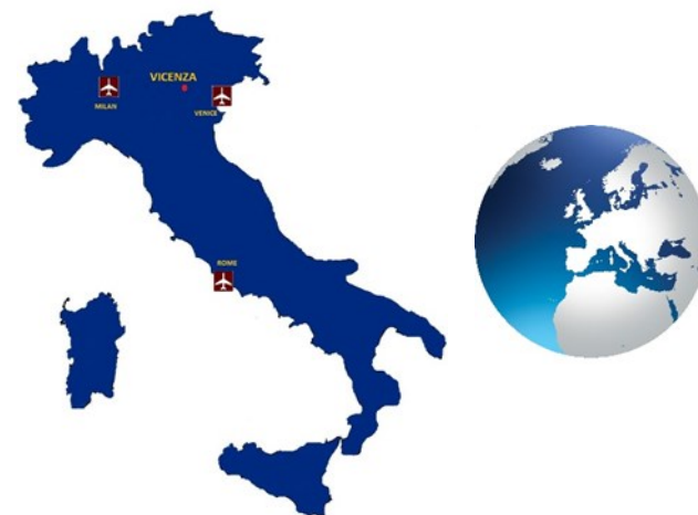
Framework Nation: Italy